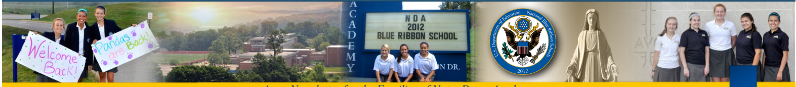
An e-Newsletter for the Families of Notre Dame Academy